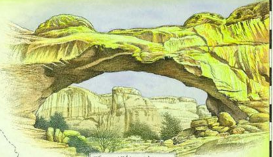
HICOMAN NATURAL BRIDGE