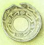
Treasury Artifact and Petroglyphs