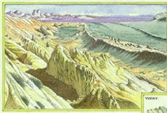
"WATERPOCKET FOLD" - A NEARLY 100 MILE LONG VALLEY IN THE EARTH'S CRUST, WAS FORMED BY PROCESSES OF DEPOSITION, UPLIFT AND EROSION.